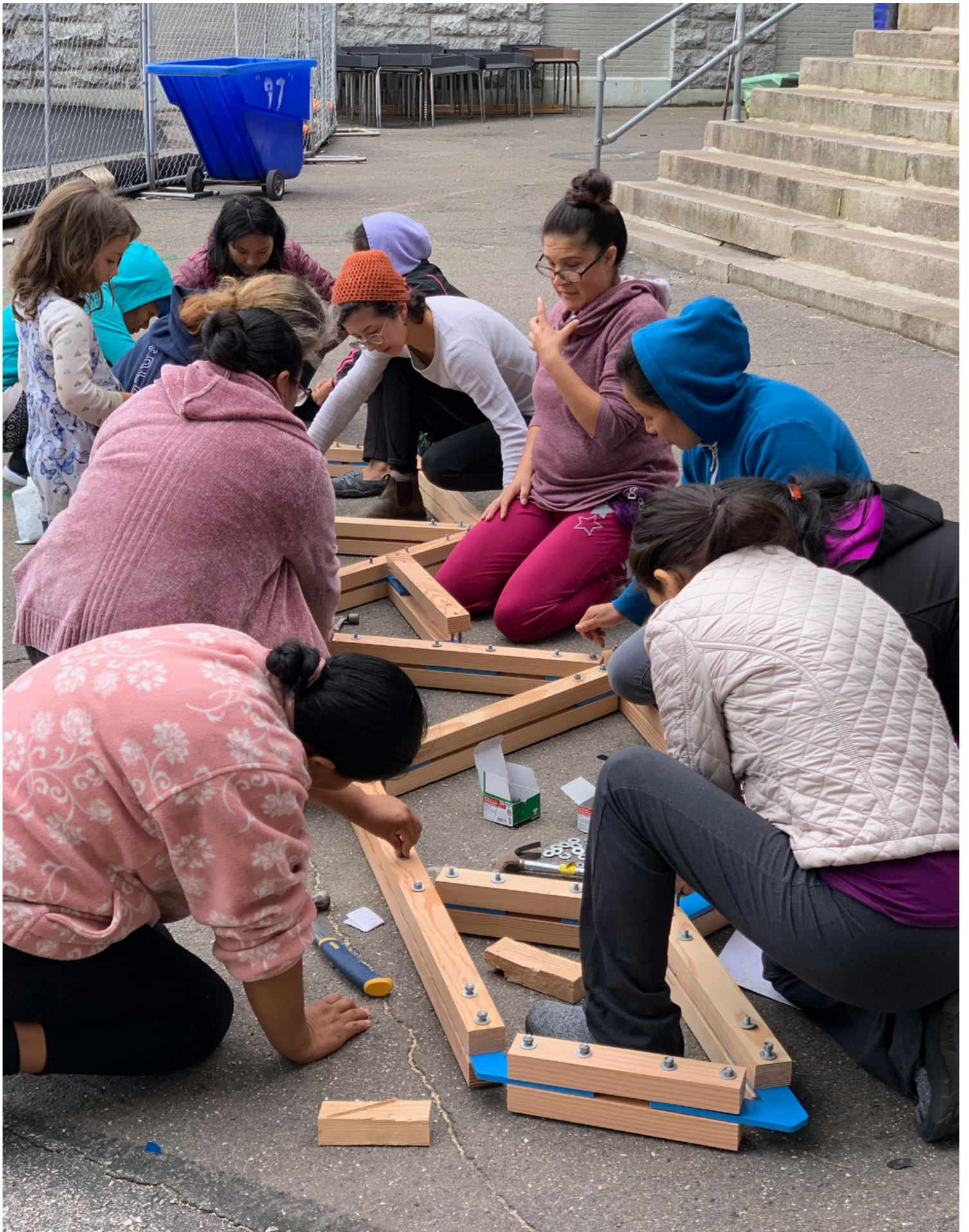
Building the makerspace. Our Park/Southwark © 2019 City of Philadelphia Mural Arts Program / Basurama Collective, Southwark School, 1835 South 9th Street.