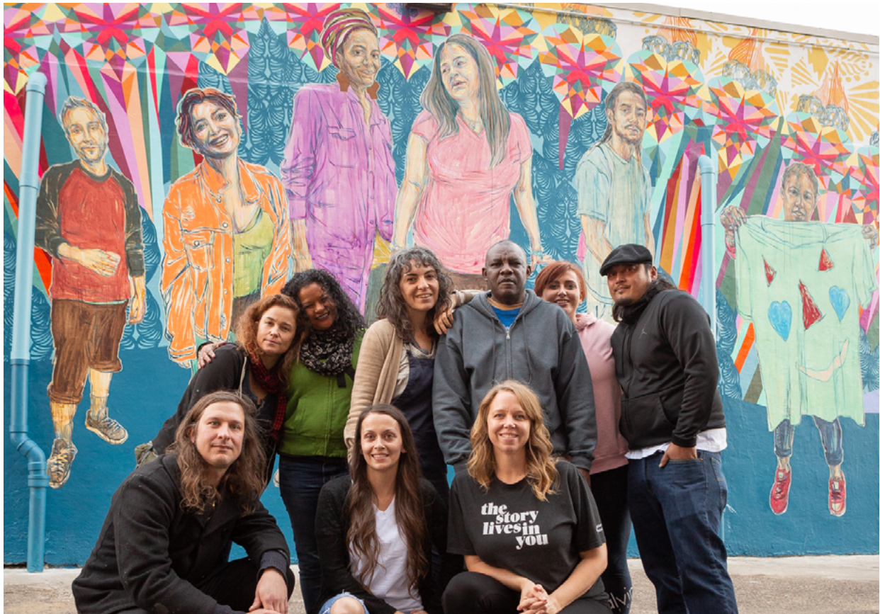
Healing Begins Through Connection © 2018 City of Philadelphia Mural Arts Program / Swoon, 2913 Kensington Avenue.