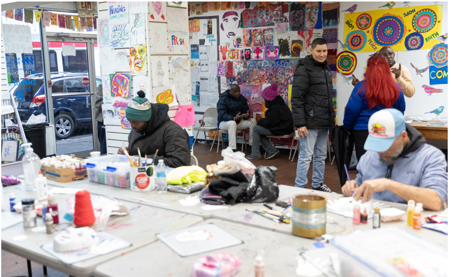
Voices of Survivors workshop at the Kensington storefront, February 22, 2019.