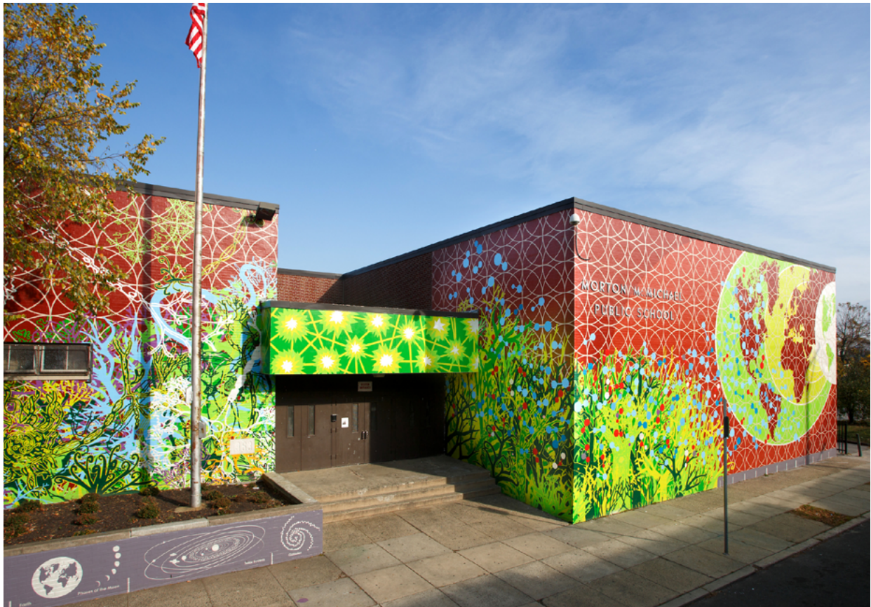
Micro to Macro © 2014 City of Philadelphia Mural Arts Program / Benjamin Volta. Morton McMichael Elementary School, 3543 Fairmount Avenue.

mural features a map of the world that, on one side morphs into trees. The trees branch out to images of neurons. It then zooms in on DNA, atoms, and particles. On the opposite side, the map scales out and provides images of the earth and the larger universe. Each aspect of the mural incorporates drawings directly from, or inspired by, the student participants. Members of the Restorative Justice Guild helped to install the mural that wraps two full sides of the school building and continues into the interior entryway. Community members and PECO employees also helped to paint the mural during paint days.