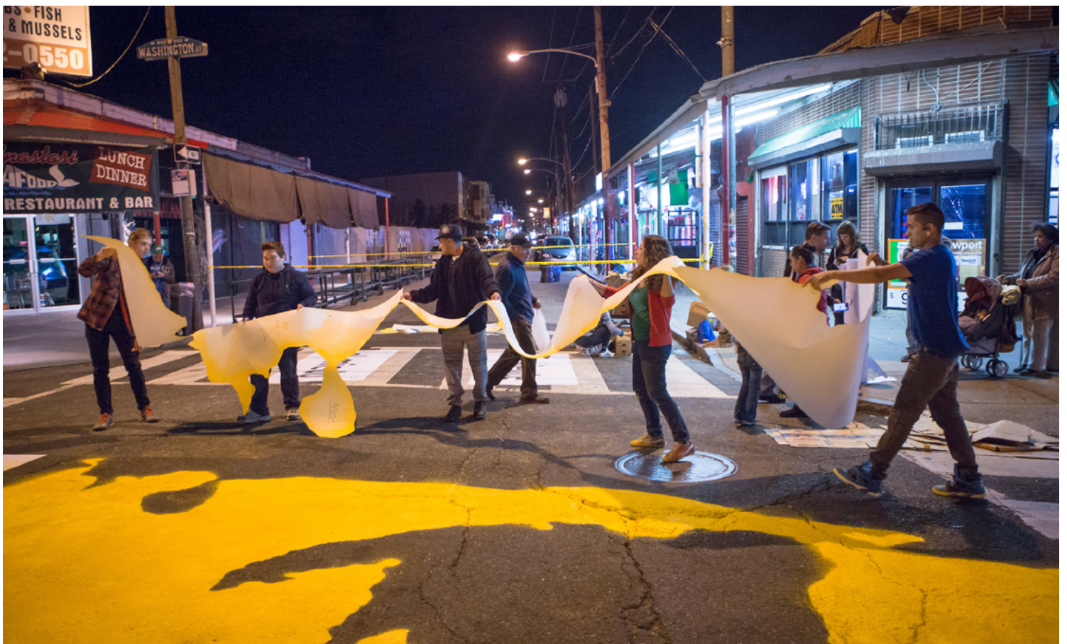
Se Siente El Miedo (I Feel the Fear) installed at the 9th Street Outdoor Market, Philadelphia