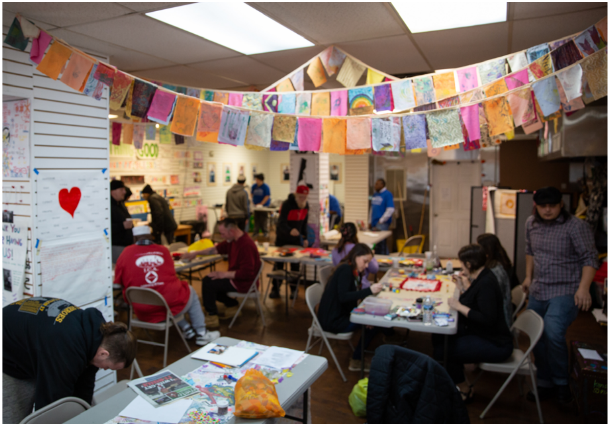
Voices of Survivors workshop at the Kensington storefront, February 22, 2019.

homelessness and opioid use disorder. The Kensington Storefront saw an uptick in the number of people in this situation coming by the space. It shifted its programming and services accordingly. Since then, the Kensington Storefront has developed into a safe space for wellness-focused artmaking and reflection. It strives to welcome all who come through the door and recognize their dignity. The storefront connects individuals to organizations that provide services and referrals that they might not otherwise encounter. It also serves as a hub for area organizations to collaborate.