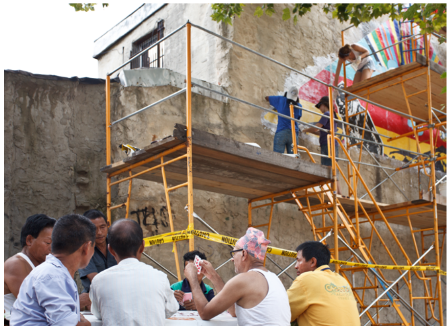
Southeast by Southeast mural in-process, July 15, 2013.