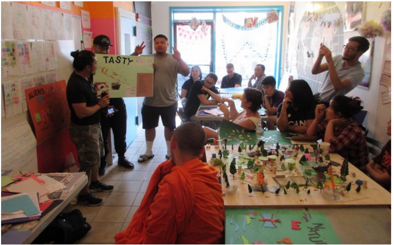
Mifflin Square meeting at Southeast by Southeast, 2017.