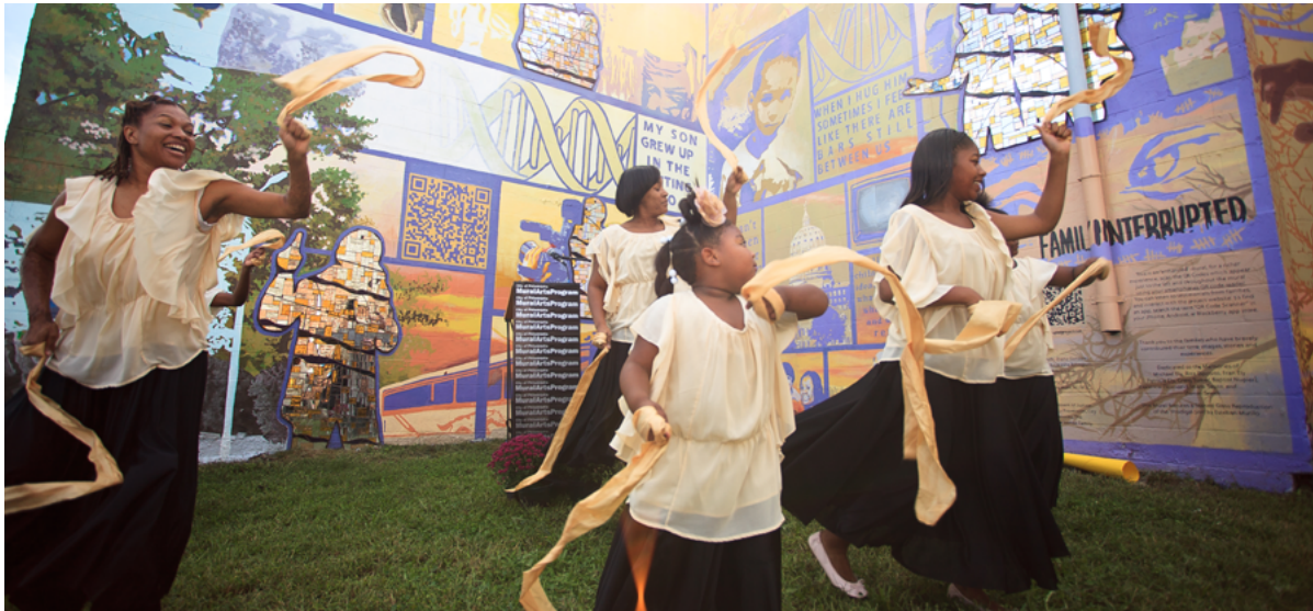
Dancers from the King Solomon Baptist Church at the mural dedication. Family Interrupted © 2012 City of Philadelphia Mural Arts Program / Eric Okdeh, 709 West Dauphin Street.