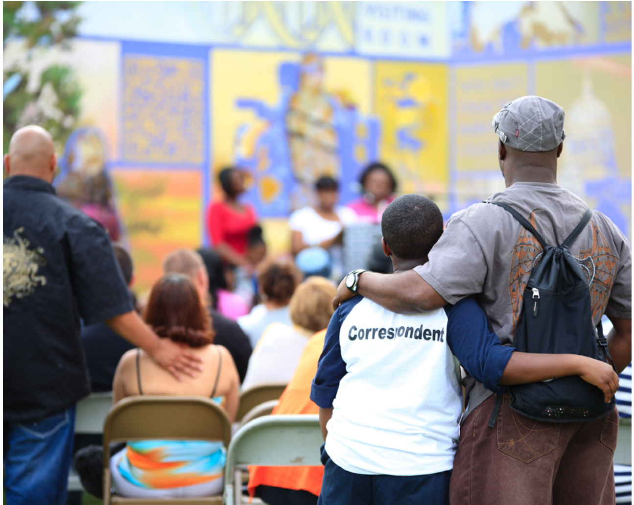
Mural dedication. Family Interrupted © 2012 City of Philadelphia Mural Arts Program / Eric Okdeh, 709 West Dauphin Street.